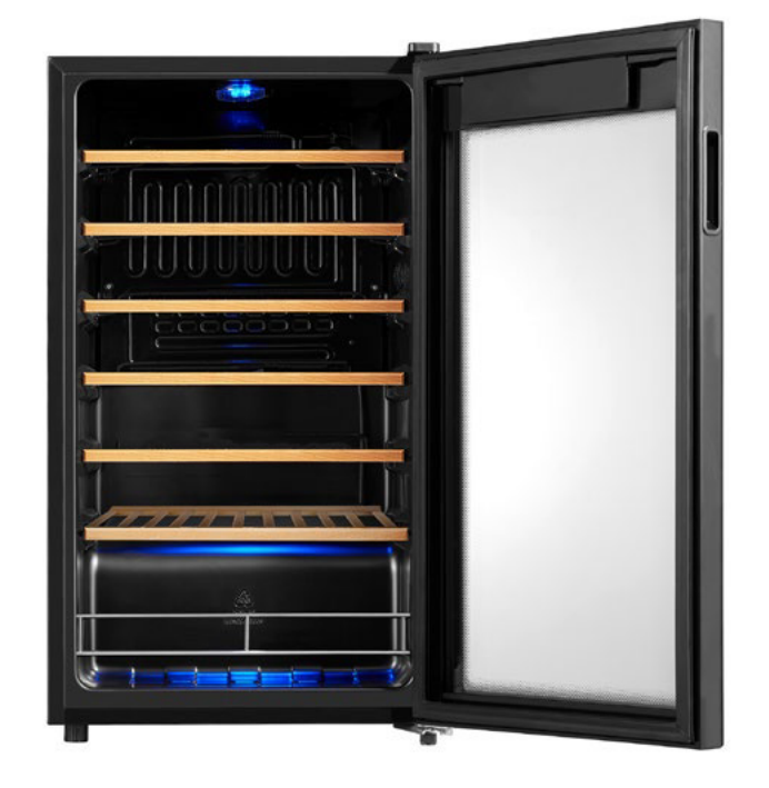
Black Trim Shown