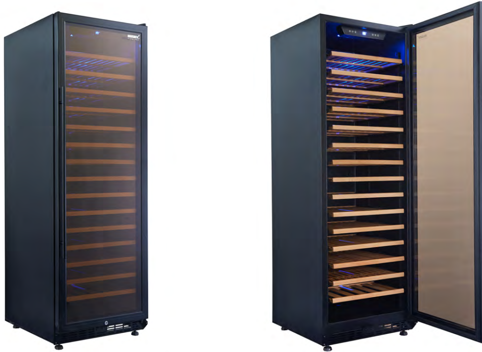
Black Trim Shown