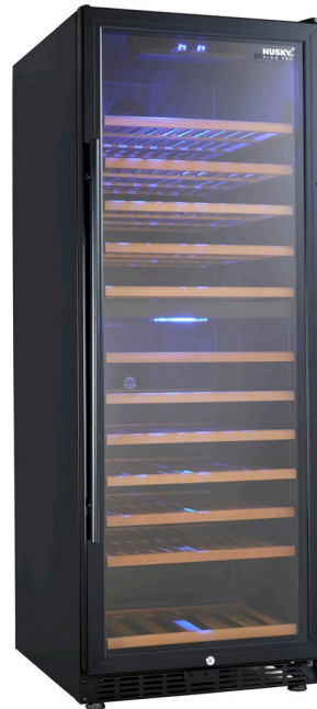
Black Trim Shown