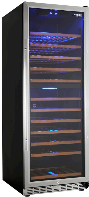
Stainless Steel Trim Shown